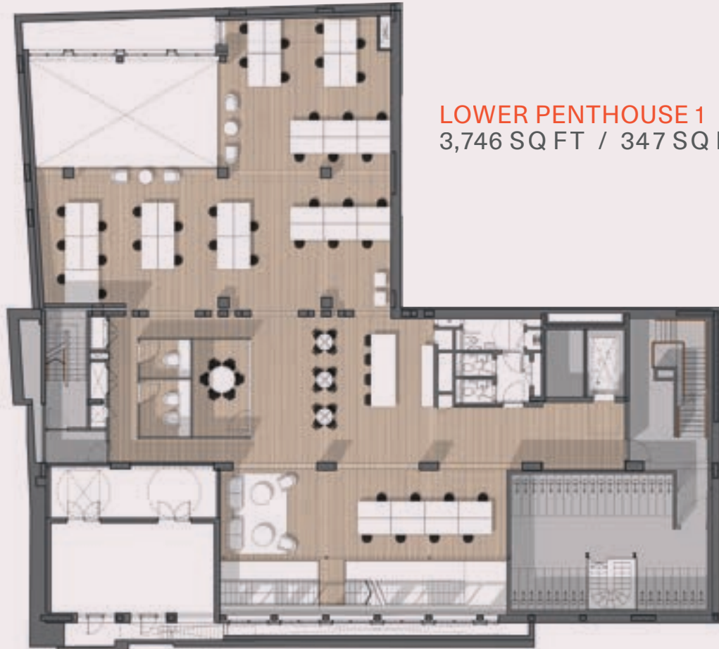
LOWER PENTHOUSE 1 3,746 SQ FT / 347 SQ M